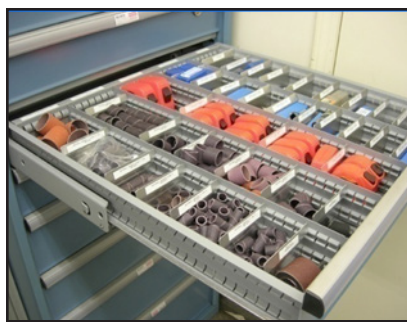
Manage abrasives and MRO items