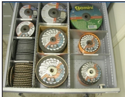
Manage grinding, sanding, & cut-off wheels

Please Note: specifications, models, software etc. can change without notice