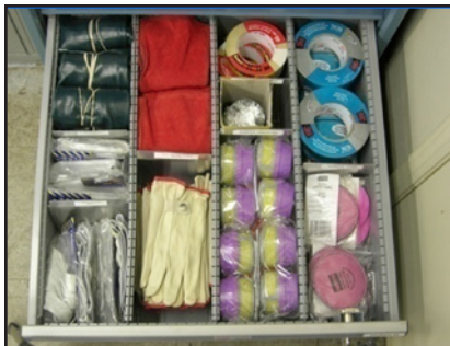
Manage safety supplies