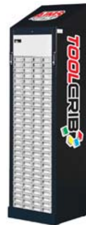
TOOLCRIB SLAVE Compartment Security For Small to Medium Size Items

Each drawer can be subdivided into as many as 12 compartments.