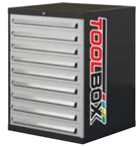
TOOLBOX Drawer Level Security For Large & Bulk Items