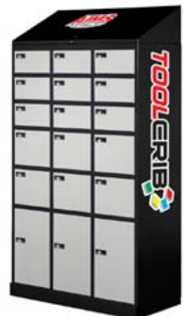
TOOLCRIB Lockers Locker Door Security For Large or Bulk Items

Additional add-on units include the TOOLBOX cabinet, TOOLCRIB Slave and TOOLCRIB Lockers. All of these add-on units are electronically controlled by the TOOLCRIB they are connected to. TOOLCRIB has the ability to accommodate 14 of these add-on units to 1 TOOLCRIB.